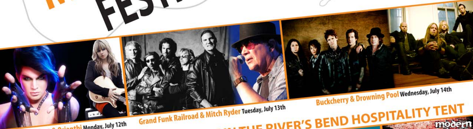
Adam Lambert & Orianthi Monday, July 12th

Chesaning Showboat Box Office P.O. Box 83, 218 N. Front Street Chesaning, MI 48616