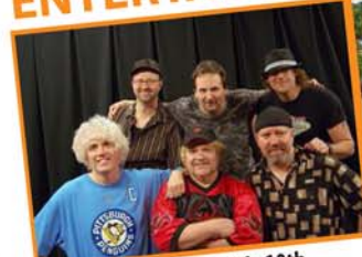
ApologetiX Saturday, July 10th Praise Day In The Park