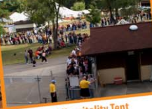
River's Bend Hospitality Tent Nightly Before and After The Show