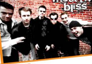
Modern Bliss Fri. & Sat. July 16th & 17th In The Tent